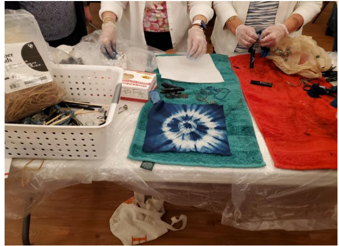
Show and Tell